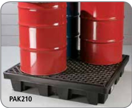
PAK210 PIG Poly Spill Containment Pallet The strongest standard pallet you can buy. Molded-in sump helps you comply with regs.