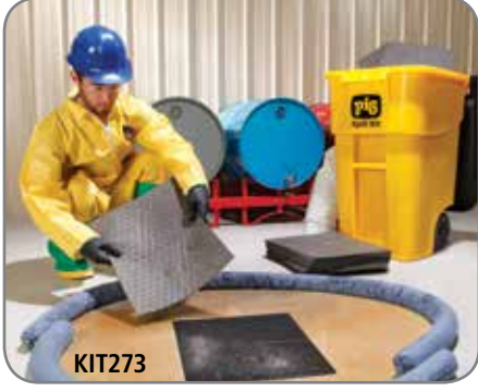
KIT273 PIG Spill Kit in High-Visibility Mobile Container Lightweight hi-viz container kit rolls to spills of up to 37 gallons.