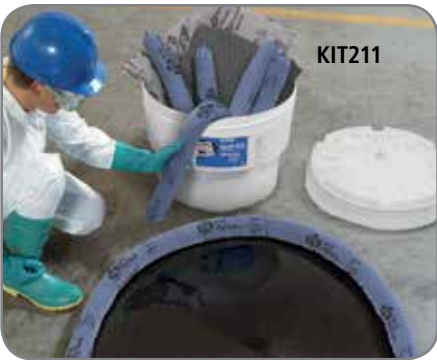
KIT211 PIG Spill Kit in 20-Gallon Overpack Salvage Drum Strong enough to earn a UN rating for shipping spill cleanup waste.