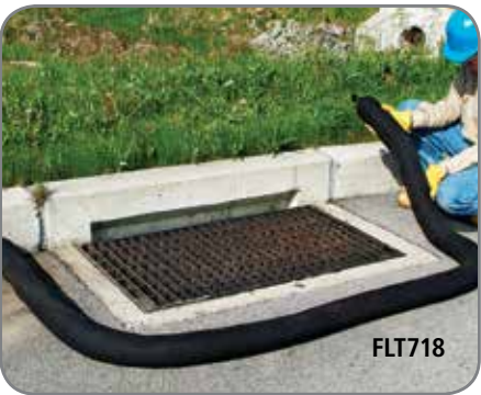
FLT718 Filtrexx FilterSoxx with MetalLoxx Protect storm drains from pollutants including sediment, debris, hydrocarbons and chemicals.