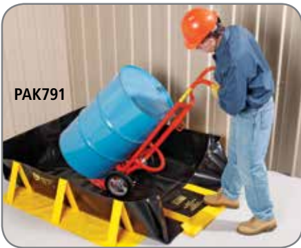
PAK791 PIG Collapse-A-Tainer Spill Containment Berm Create affordable containment anywhere you need it in just a few minutes.