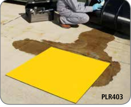
PLR403 PIG DrainBlocker Drain Cover with DuPont Elvaloy Protect your drains with our patented design that seals tight and won't rip. Guaranteed.