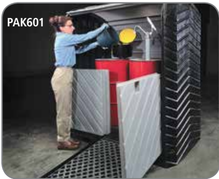
PAK601 PIG Roll Top Hardcover Spill Pallet Roomy roll top hardcovers offer all-weather protection and liquid containment.