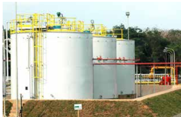
Concrete berms can contain catastrophic tank failures.

If your secondary containment needs vary from one month or job to the next, collapsible containment may be the perfect solution. A collapsible system is similar to an aboveground swimming pool, but it's designed to be very rugged and compatible with many common industrial fluids. Collapsible containment deploys very quickly and the walls fold down to allow vehicle traffic. When finished, you can fold up the system and transport it to the next job or store it until it's needed.