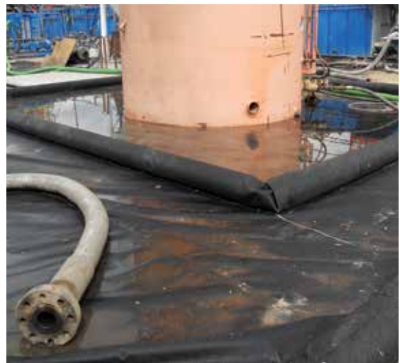
Passive containment — like this drilling site berm — doesn't have to be permanent, just effective.