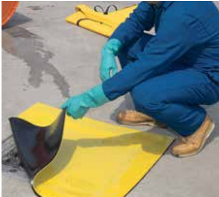
If a person has to deploy it, it's active.

Active containment means that someone has to take action to put the containment devices in place. The containment may be deployed before an activity begins or in reaction to a discharge, but it requires people.