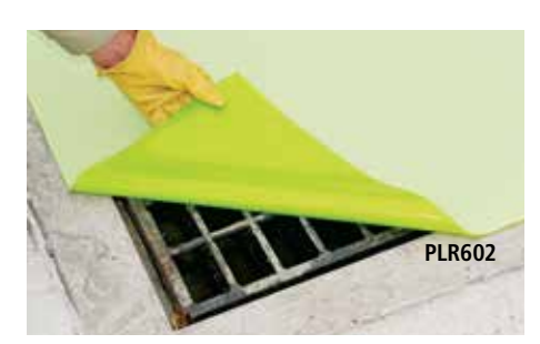
<u>PIG Rapid Response DrainBlocker</u> Meet regs with a cover that's affordable enough to place near drains in all your spill-prone areas.