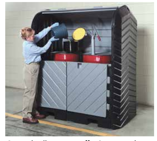
Covered pallets are an effective way to keep rain and snow out of the sump.