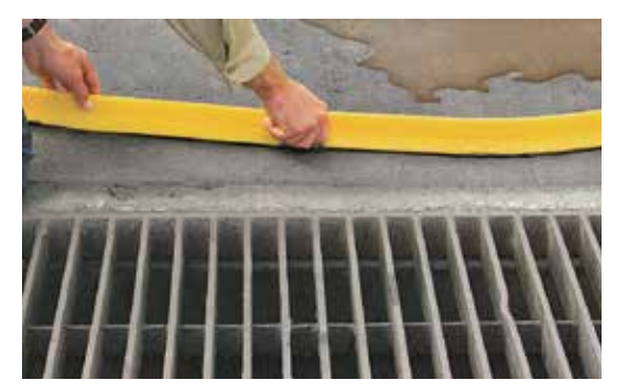
Nonabsorbent dikes are an effective way to stop the spread of spills.

The act of stopping a spill is spill containment . It's part of spill response . Spill response plans often contain different types of spill containment to address different types of spills, including absorbent socks or booms, nonabsorbent dikes or even drainage sumps designed to collect spilled liquids. For example, spill containment for a 5-gallon oil spill in a warehouse with no floor drains might call for a few socks and absorbent mats, but spill containment for a 30,000-gallon fuel spill heading toward a nearby river is going to take a full arsenal of booms, absorbents, vacuums and sumps to control.