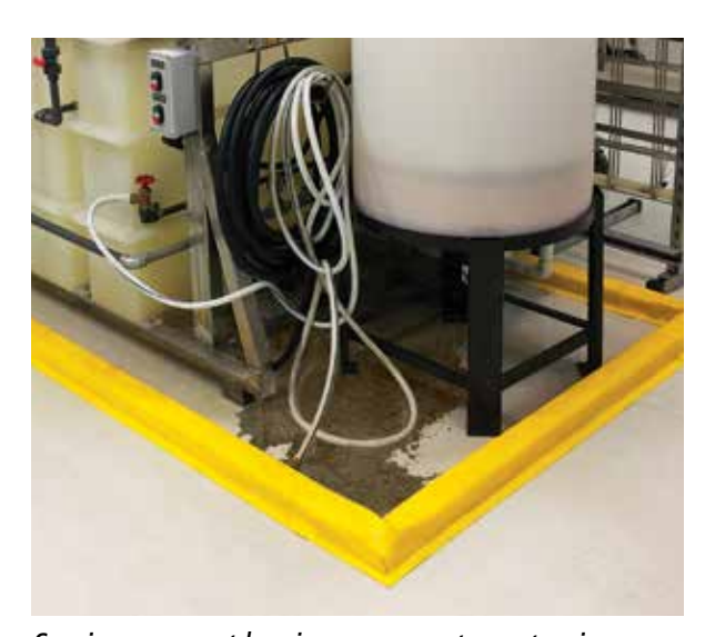
Semi-permanent barriers are easy to customize.

Secondary containment can be anything from spill pallets or decks to a sloped room that allows the liquid to accumulate at one end until it can be cleaned up. It could be dikes, berms or concrete walls that create a moat around the primary container. In some cases it can even be absorbents. It's up to you.