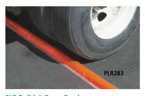
PIG Build-A-Berm Barrier Lets you create permanent custom secondary containment anywhere you need it.