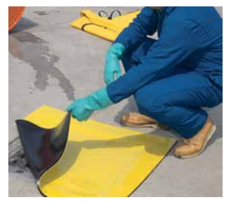
If a person has to deploy it, it's active.

Active containment means that someone has to take action to put the containment devices in place. The containment may be deployed before an activity begins or in reaction to a discharge, but it requires people.