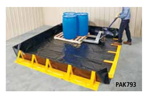
PIG Collapse-A-Tainer Spill Berm Portable, drive-in secondary containment that sets up in minutes.