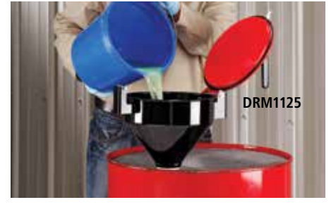
Provides no-splash filling and latching lid for easy hazardous waste compliance.