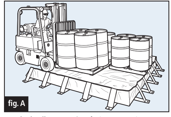
Standard Collapse-A-Tainer for instant containment.

Please record your serial number here for future reference when contacting us: