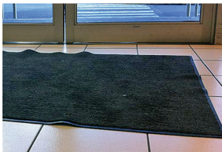
When rental floor mats don't stay flat, they're a tripping hazard.

Rental floor mats were part of Market Basket's floor safety program that also includes wet floor warning cones, spill cleanup procedures, regularly scheduled floor cleaning, employee training and incident documentation. Every store used the mats wherever moisture was a problem — placing them at entrances and in front of the produce and egg cases, ice machine and fresh flower display. But even though they were doing everything right, customer trip-and-