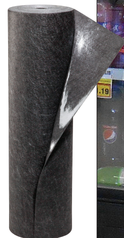
GRP36200 36" x 100' Roll