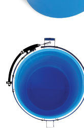
Drum lid with spacer #1 installed.