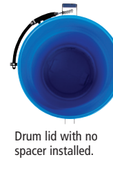
Drum lid with no spacer installed.