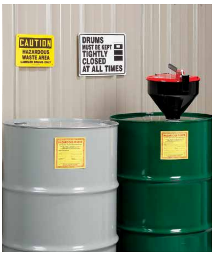
Hazardous wastes must be clearly identified so workers can handle, collect, manage, store and dispose of them properly.

information about the type, quantity and weight of the hazardous materials onsite and being shipped on their aircraft. Their failure to identify, correctly label and manifest hazardous products could potentially lead to hazardous reactions or other problems during onsite storage, transport or disposal.