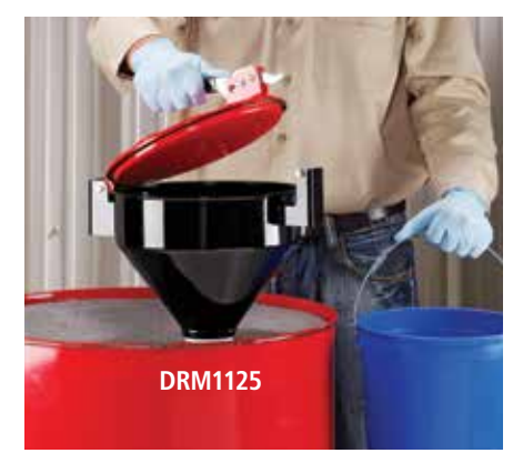
PIG Burpless Steel Drum Funnel Protect eyes and face during pouring by eliminating dangerous splashback.