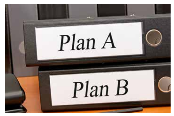
Create plans and backup plans that detail what employees should do in certain hazardous waste spill situations.

Contingency plans are unique to every facility and need to be maintained and updated periodically or when processes, equipment or personnel change. When contingency plans are in place and everyone at the facility is trained to know what to do during and after a spill or other emergency, safety is easier to ensure and the incident can be mitigated faster.