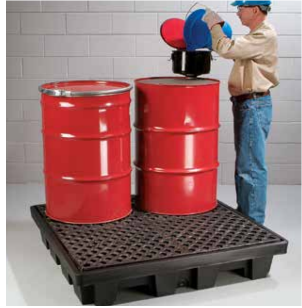
Adhere to EPA regulations in satellite accumulation areas to avoid violations.

The use of satellite accumulation areas can also help facilities minimize the chance for leaks and spills. Because wastes are collected near their point of generation, employees don't have to carry their wastes from the processing area to a centralized collection point every day, decreasing the possibility of leaks and drips happening along the way.