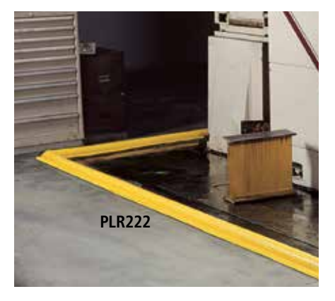
<u>PIG Build-A-Berm Barrier Kit</u> A semi-permanent, high-visibility barrier that's exactly the size and shape you need.