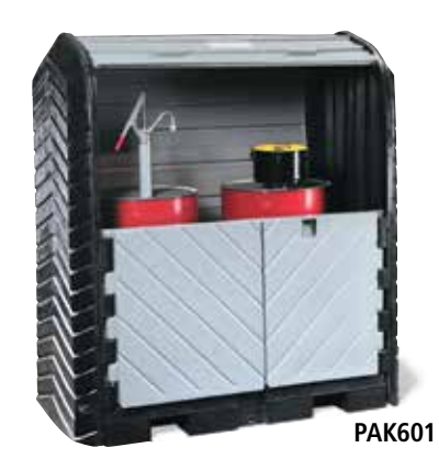
<u>PIG Roll Top Hardcover Spill Pallet</u> Roomy roll top hardcovers offer all-weather protection and liquid containment.