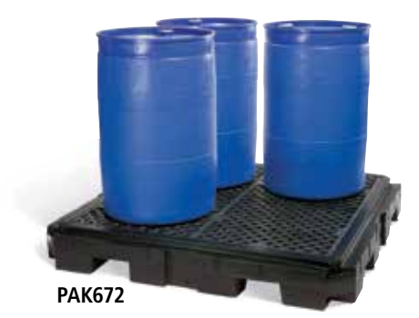
PIG 4-Drum Heavy-Duty Spill Pallet Strongest pallet you can buy. Spill containment prevents spills from reaching floor.