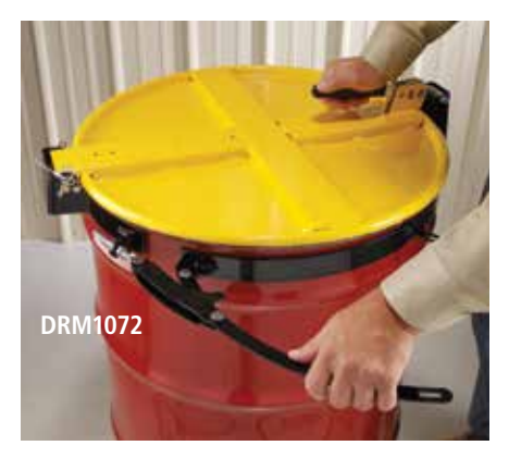
PIG Latching Drum Lid with Fast-Latch Ring The convenience of one-handed latching with the mounting speed of a fast-latch ring.