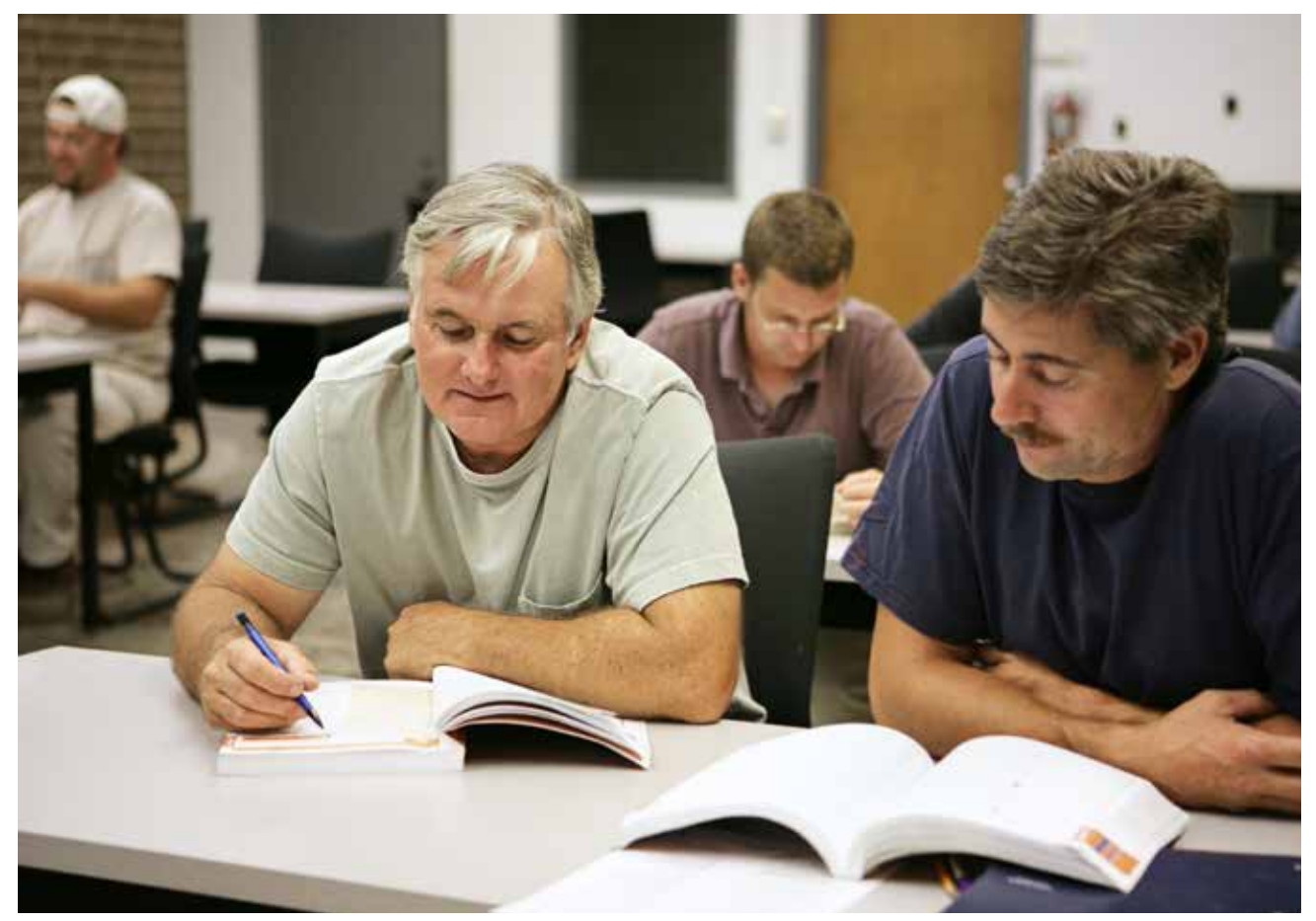
Failure to train employees how to manage hazardous waste can cost companies millions of dollars.

Failure to provide training can be very costly. The nation's largest retailer was recently fined over $80 million for failure to train employees about proper hazardous waste management. This fine was levied because employees in several different states routinely dumped paints, bleach, pesticides and other hazardous materials into drains or placed them in dumpsters with nonhazardous wastes instead of labeling and managing them properly.