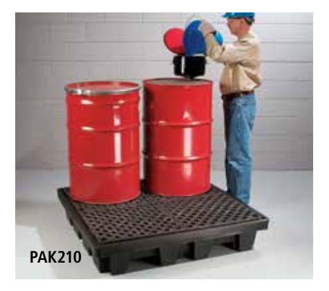
PIG 4-Drum Poly Spill Pallet Tough, affordable containment can't be beat for everyday drum storage.