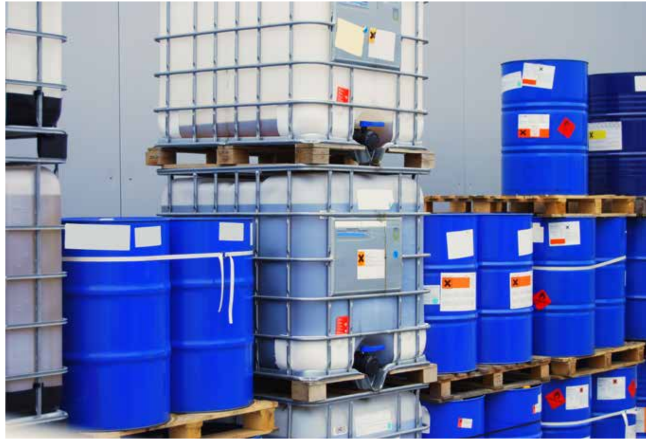
Determine what wastes, hazardous or not, should be segregated by labeling containers with contents.

Labeling containers properly helps keep waste streams segregated so that materials can be more effectively recycled or disposed of. For example, if a facility has three waste streams (used oil, a chlorinated solvent and an aqueous coolant), keeping each waste stream separate improves safety and allows each of the wastes to be recycled at a much lower cost.