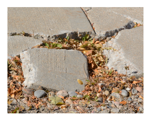
Cracked and crumbling sidewalks make walking dangerous for employees and visitors.