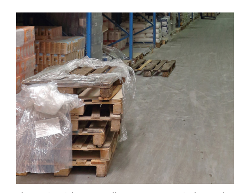
Clutter in aisles or walkways create trip hazards.

Once you've identified your Risk Zones, the next step is to eliminate slippery conditions, increase traction and remedy trip hazards. Finally, you need to follow best practices such as inspecting, repairing and maintaining walking surfaces to keep them clean, dry and safe.