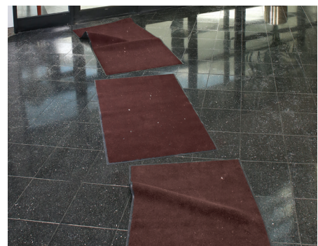
Multiple mats shift out of position producing gaps and wrinkles that cause slips and trips.